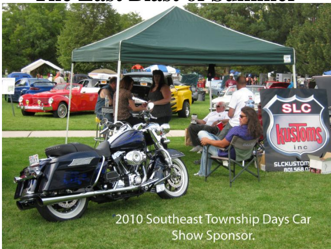
2010 Southeast Township Days Car Show Sponsor.